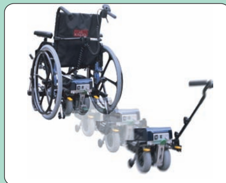
Easy to use! Mountable in just a few moments.