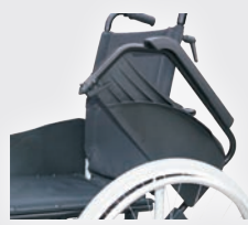
Flip backwards and removable armrests.