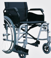
Swing away and removable footrests.