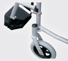
Height adjustable footplates.