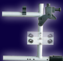
Multi-adjustable rear axle plate

Castor adjustable to change seat height. Three options, 47½, 50, 52½ cm.