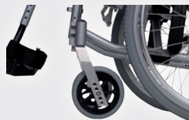
With: - Seat height adjustable. - Flat free (PU) front and rear wheels. - Angle adjustable front fork.