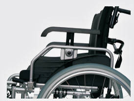
Flip-backward and detachable armrests. Height adjustable with push button (optional).