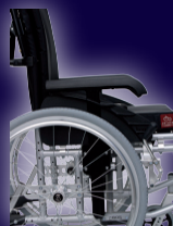
Long armrests, height adjustable and removable (optional).