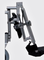
Supremely comfortable length compensating elevating legrest, includes easy adjustable calf support (optional).