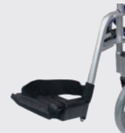
Quick release removable and swing away footrests.