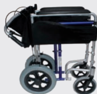
Transit wheelchair equipped with a half folding backrest.