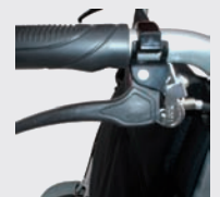
Equipped with brakes and durable push handles.