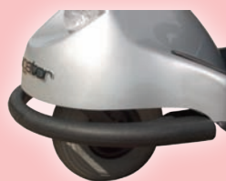
Equipped with front bumper for safety and to protect the plastic covers.