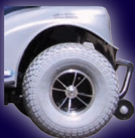
Equipped with an anti tip system.

Equipped with independent suspension on the front and rear wheels