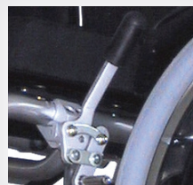
Standard equipped with angle adjustable aluminium brakes.