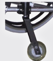
Standard equipped with design front forks solid 5" front wheels.