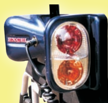
Optional lighting, see and be seen.