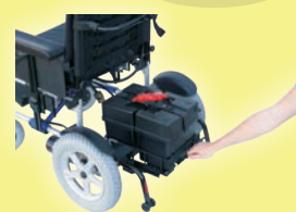
Battery packs are easy to disassemble and assemble.