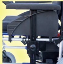
Height adjustable arm pads. Adjustable to the wishes of the user.